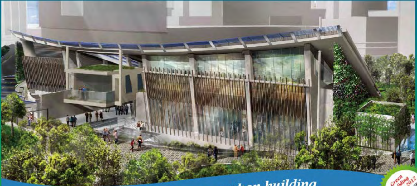
Hong Kong's 1 st zero carbon building