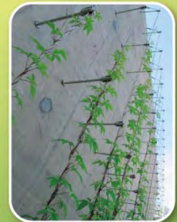
Greenwall Cabling system