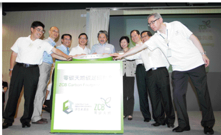
Officiating Guests Switch on the ZCB Carbon Footprint Indicator