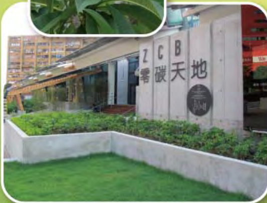
Soft landscape work