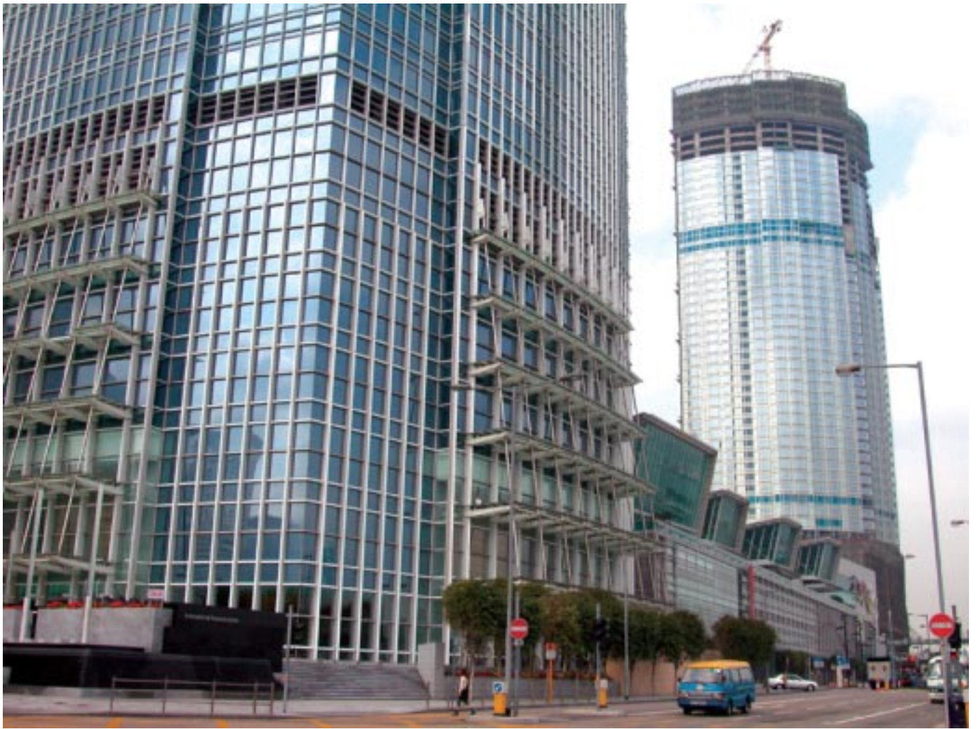
Two IFC with the Four Seasons hotels in the background