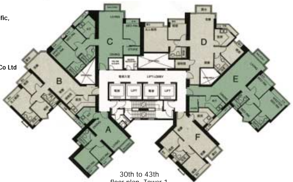
30th to 43th floor plan, Tower 1