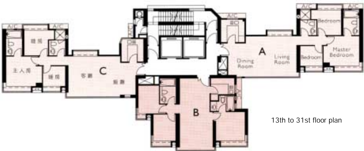
13th to 31st floor plan