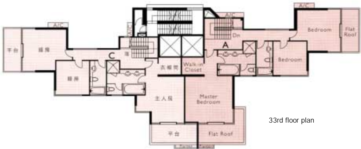
33rd floor plan