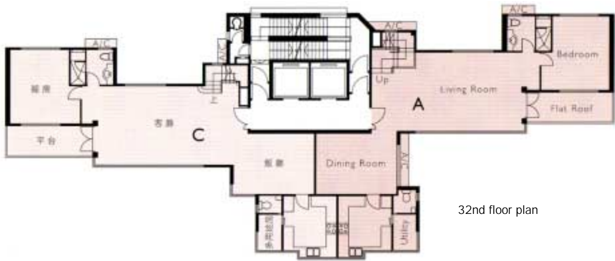
32nd floor plan