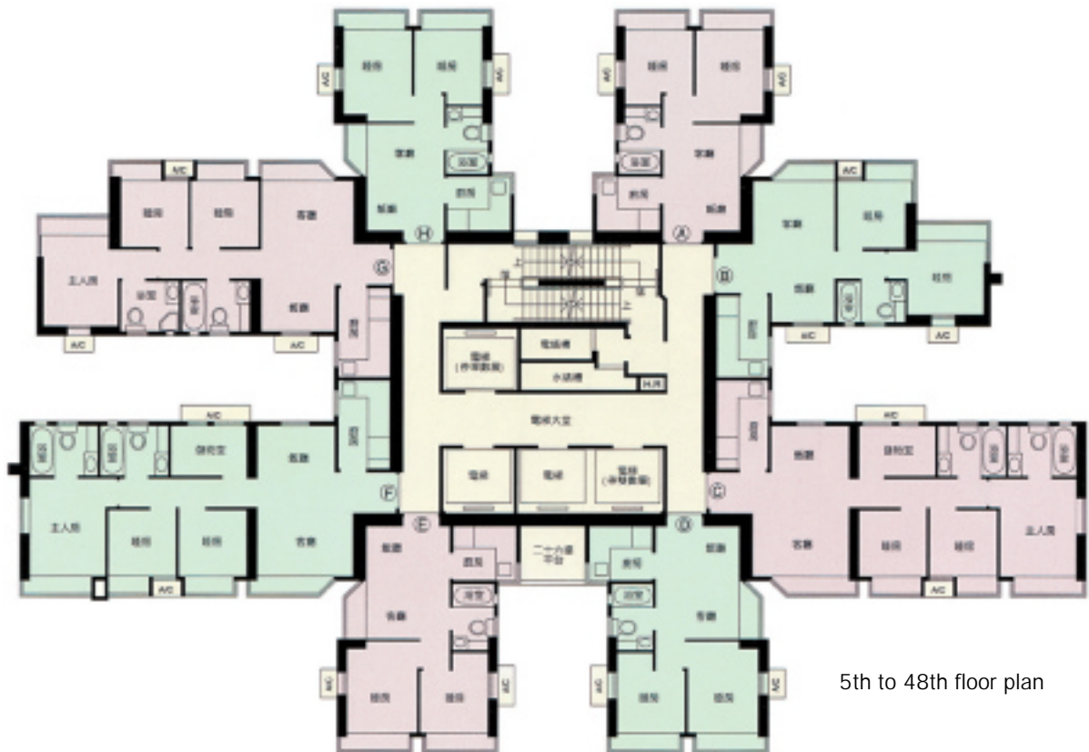
5th to 48th floor plan