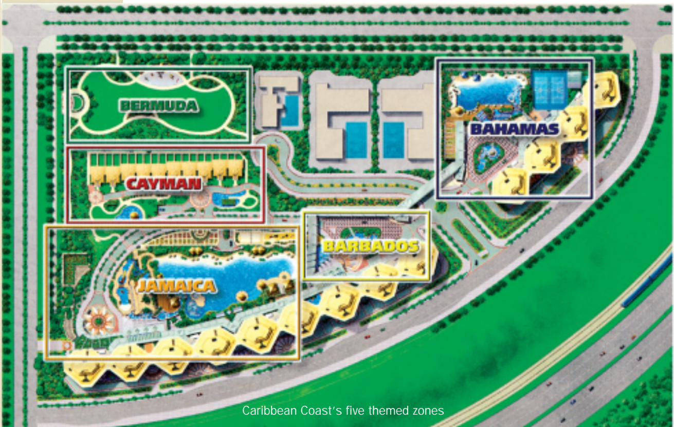
Caribbean Coast's five themed zones

位 於東涌的映灣園發展項目，完成後將包括 13 幢高密度樓宇及 10 座低密度住宅。項目在東面盡享海景優勢，而較低的樓宇置於臨近海岸線的一邊。第一期發展包括四座共 1,552 個單位，位處地盤東北端，將於 2002 年 11 月建成。單位面積介乎 636 平方呎及 1,295 平方呎之間，包括第 33 樓起的連露台單位。