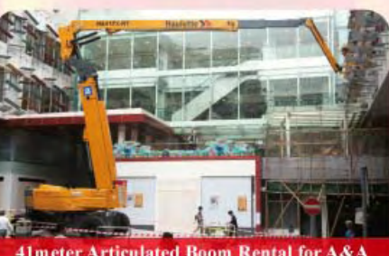
41meter Articulated Boom Rental for A&A and replacement works

Fire and Bullet Resistant Glazing System which is widely used in shopping malls, public areas, banks and business offices where special protection is needed.