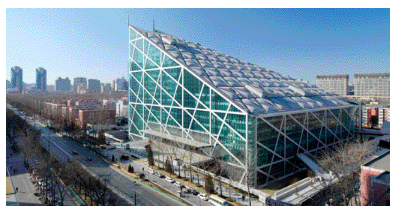
Grand Award of New Building - Completed Building (Asia Pacific) — The Parkview Green, FangCaoDi, Beijing, China