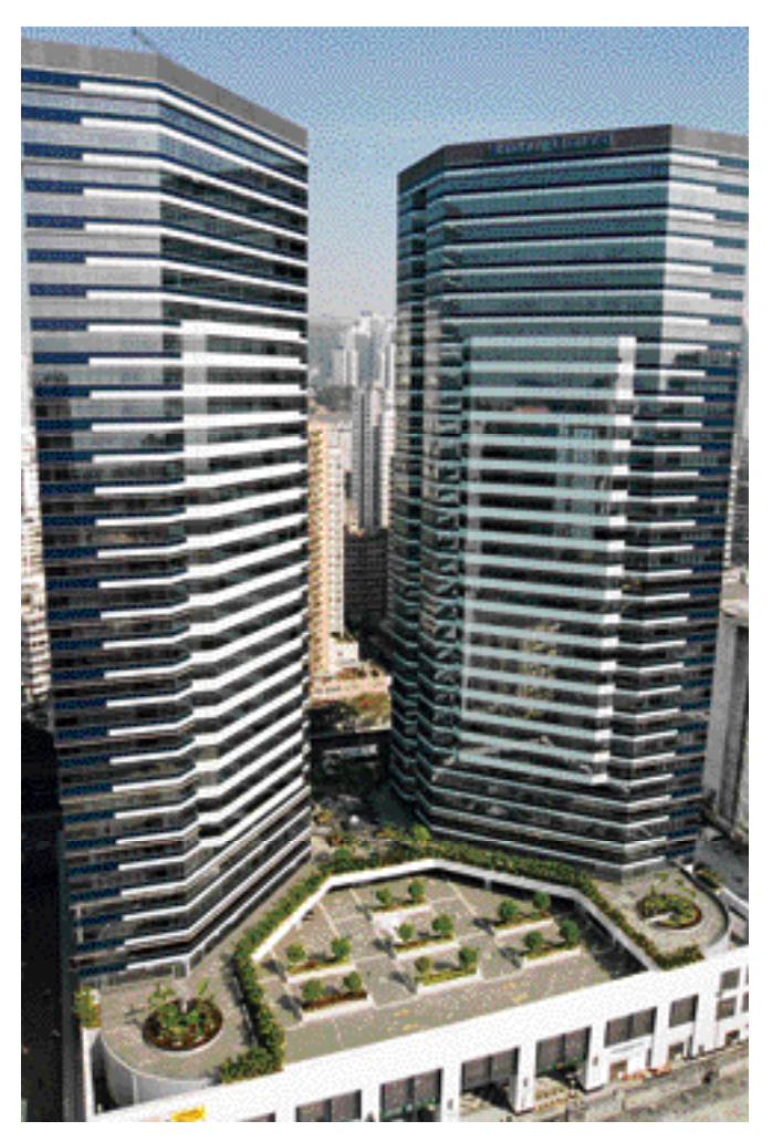
Grand Award of Facilities Management (Existing Building – Hong Kong) — Millennium City 1 - Green City