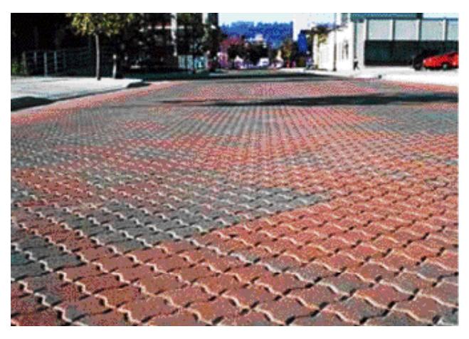
Grand Award (Building Product) — Recycling and Reuse of Marine Mud for Building Materials

For more information, please visit www.gba.hk