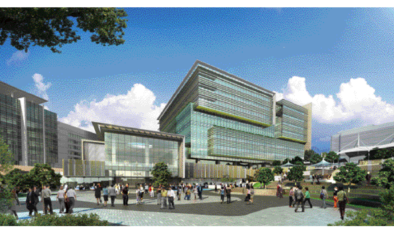
Grand Award of Building Project under Design (New Building – Hong Kong) — Hong Kong Science Park Phase 3 - Masterplan and 3a + 3b