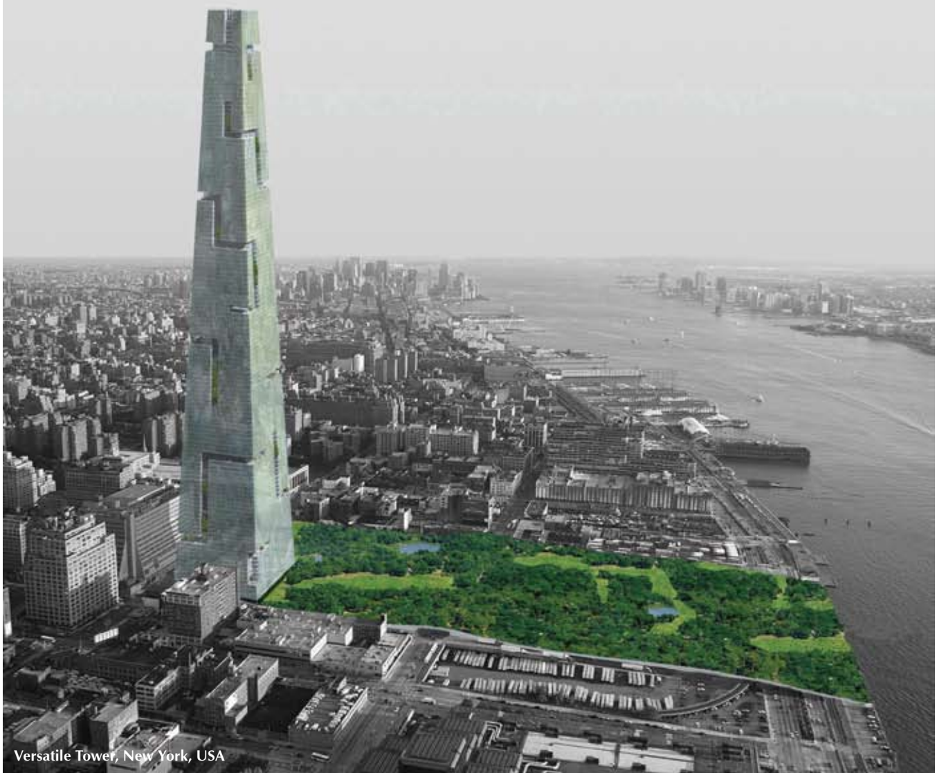
Versatile Tower, New York, USA

Mega cities like New York have very few open spaces left, and when they exist they are often occupied with major infrastructures. In this specific case, it is occupied with ground transportation that takes, every day, millions of people from a dense urban environment to their home or other getaway spaces.