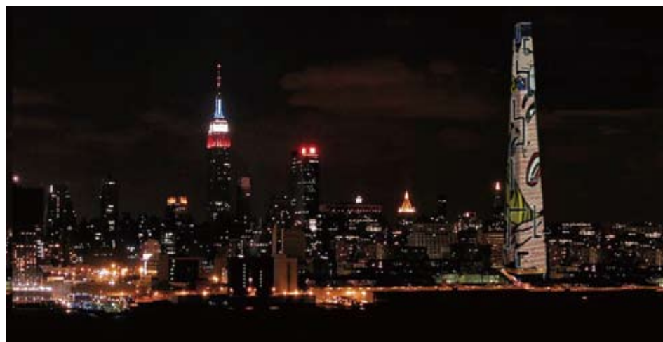
The illustration shows Versatile Tower displaying a Roy Lichtenstein exhibition opening at the MOMA

“ Its rational development creates West Park in the heart of the city. ”