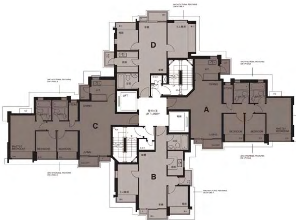
Tower 2 5-25/F floor plan