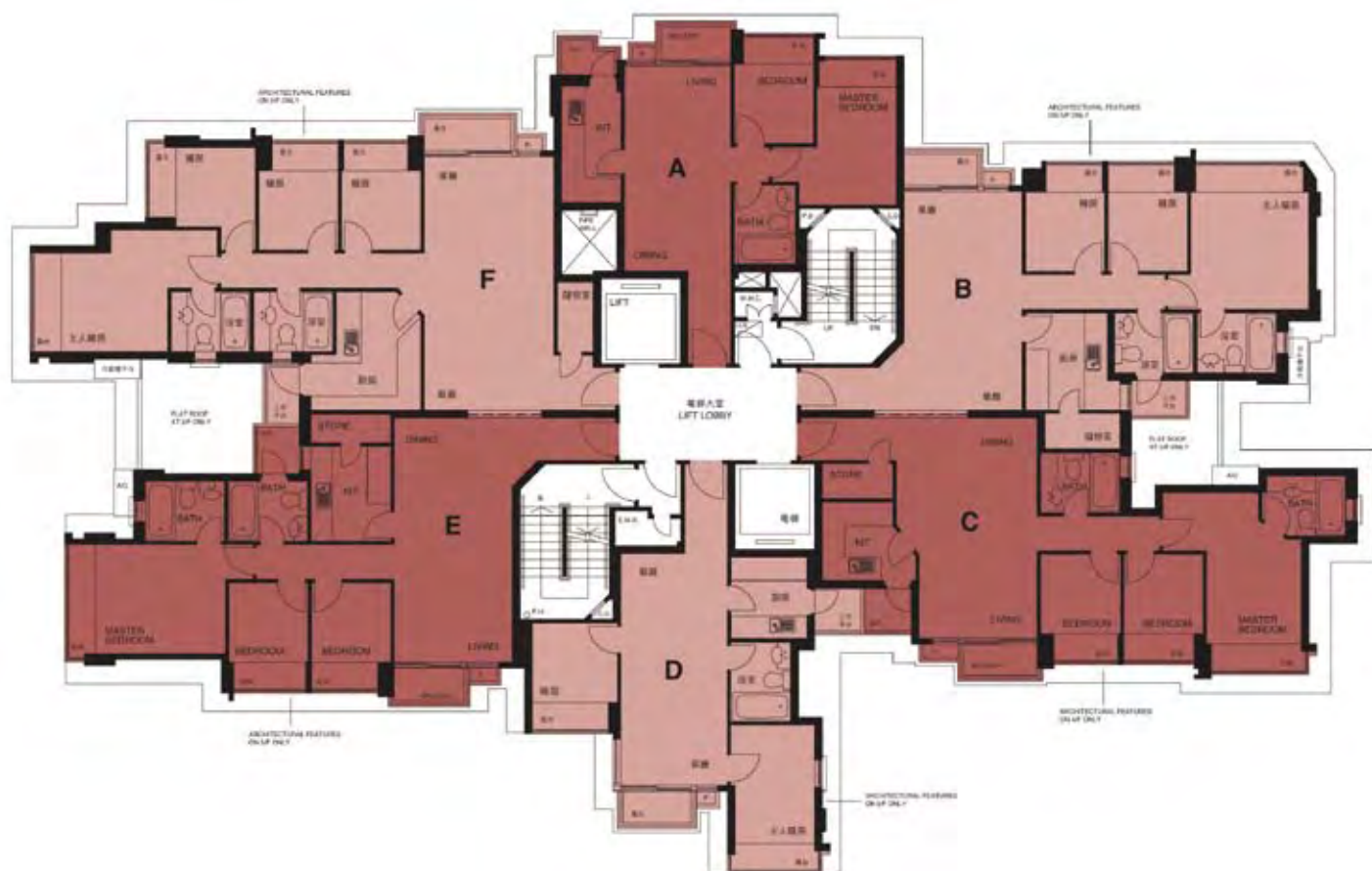
Tower 7 5-25/F floor plan