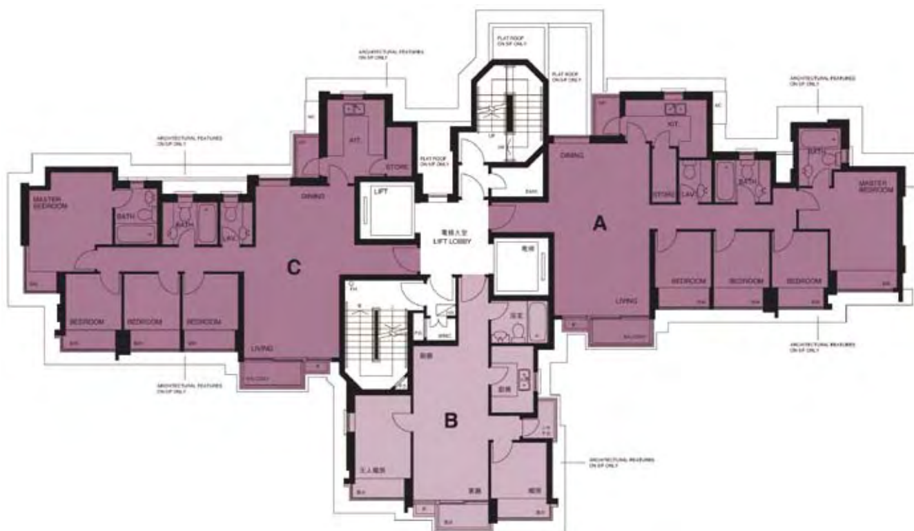
Tower 1 5-22/F floor plan