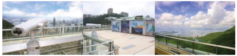
The Peak Tower rooftop Viewing Terrace

main contractor Hip Hing Construction Co Ltd