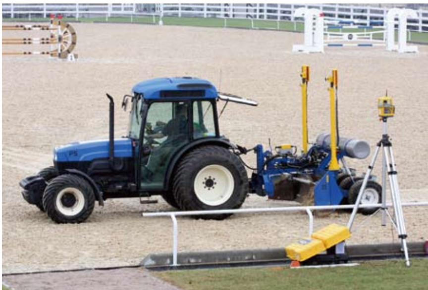
Main competition arena at Hong Kong Sports Institute