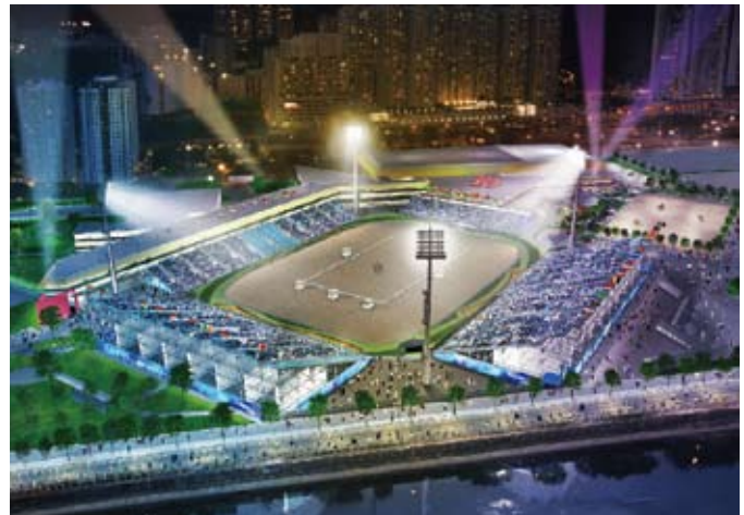
Main competition arena