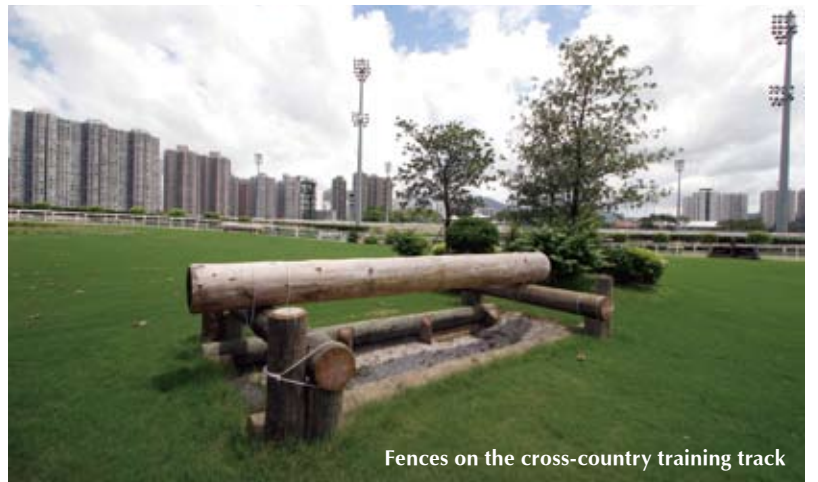
Fences on the cross-country training track