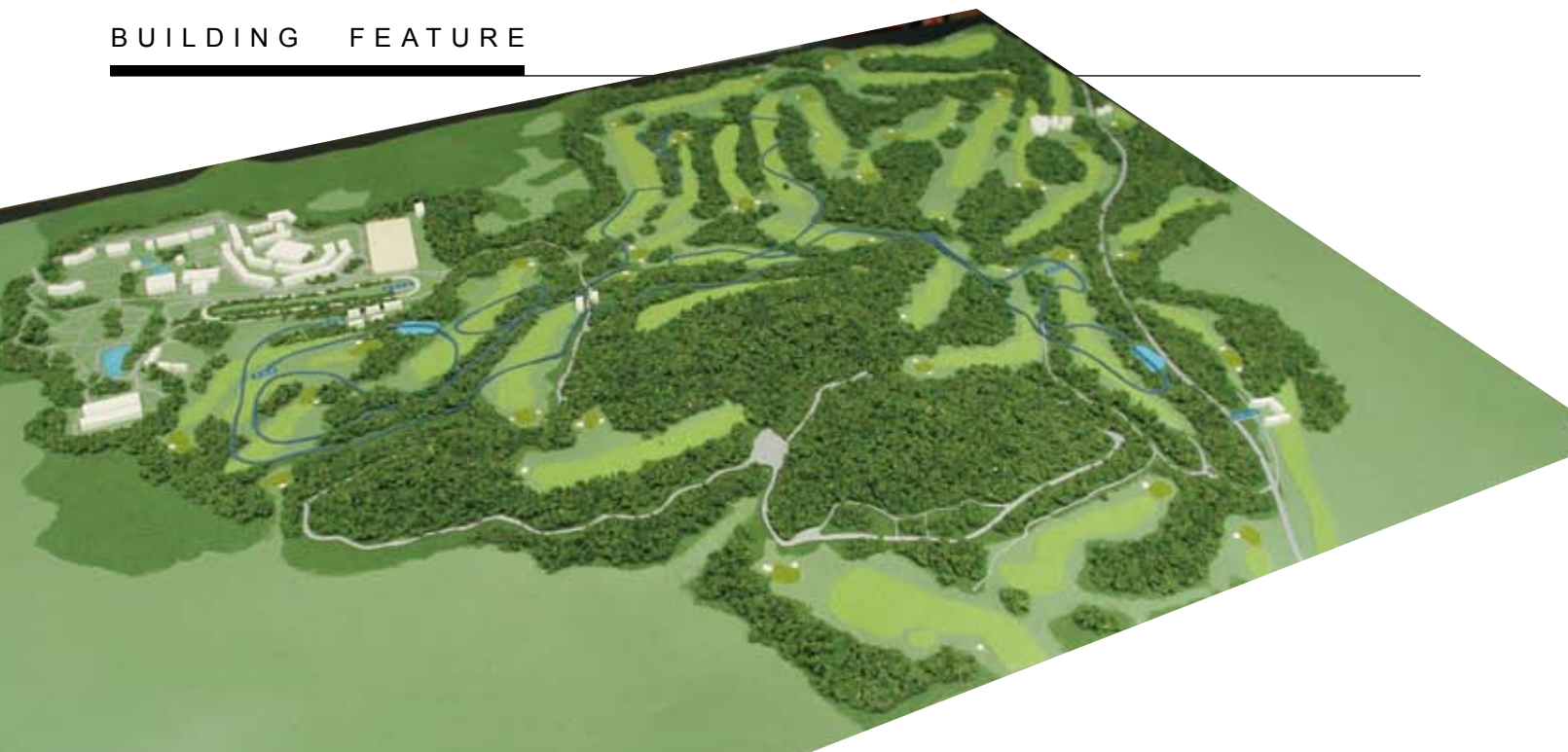
Layout plan of Cross Country Venue at Beas River Country Club