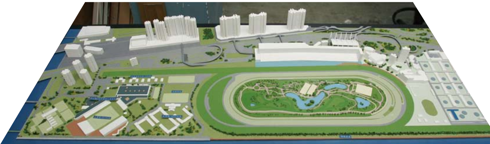
2008 Olympic Equestrian Venue – Sha Tin Racecourse