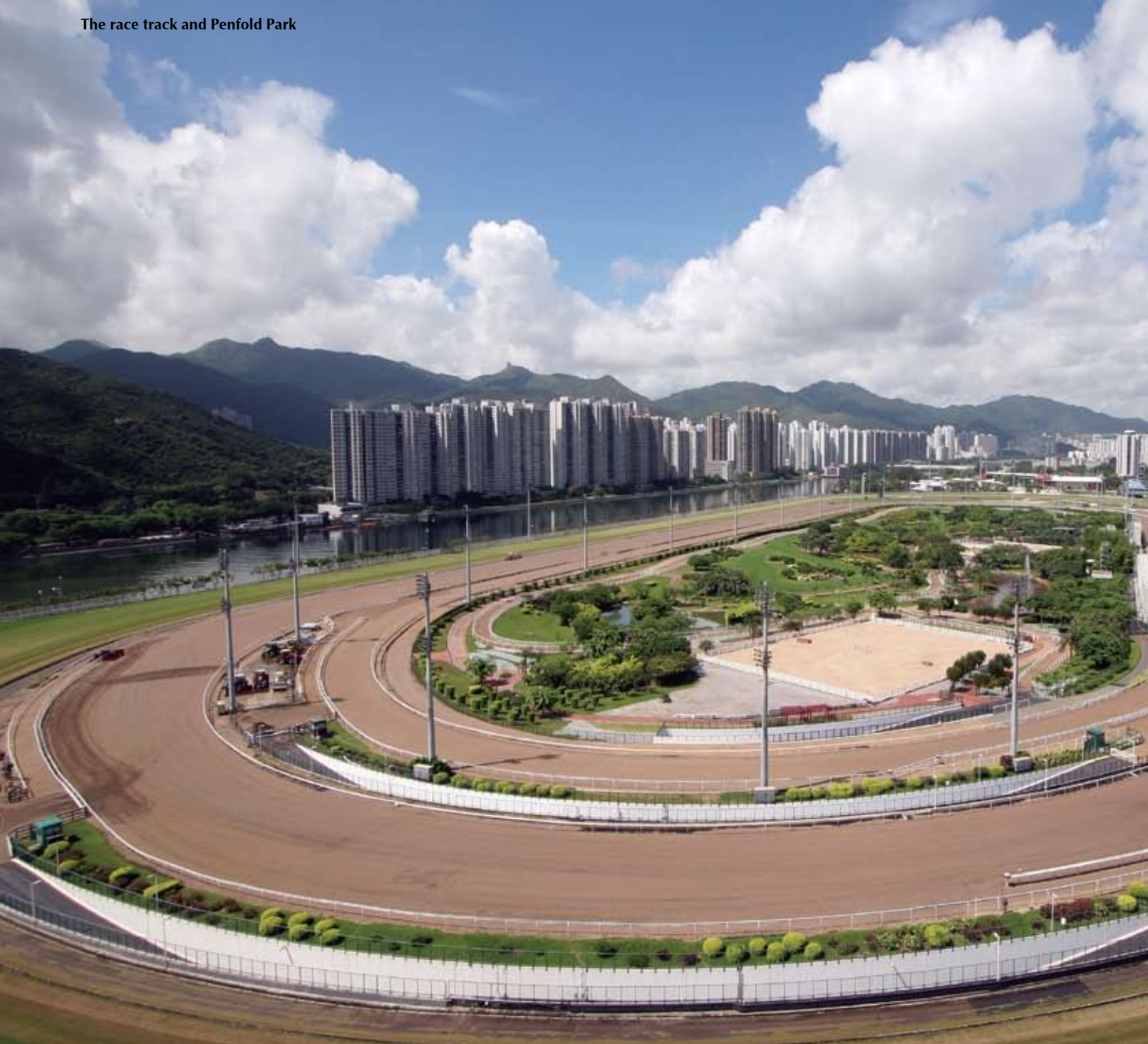
The race track and Penfold Park