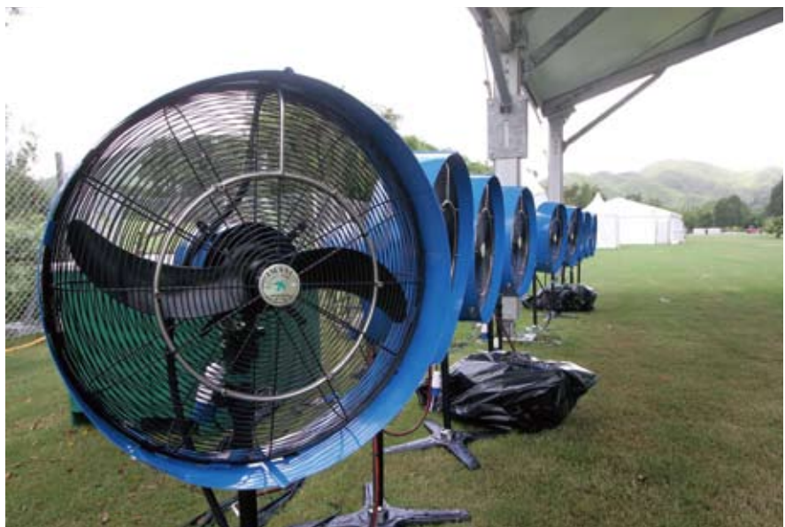
Cooling stations equipped with fans

Construction includes the modification of the HKSI and Penfold Park to provide an Olympic complex, main competition arenas