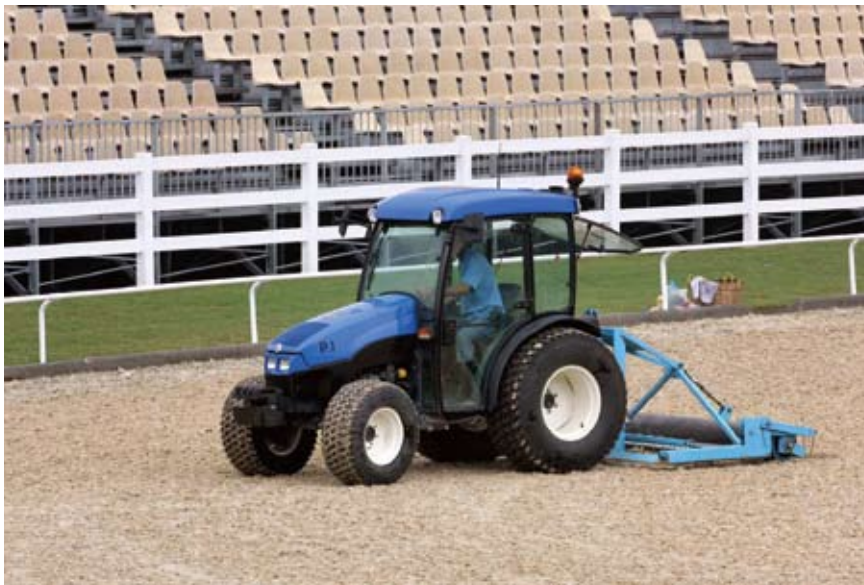
General training arenas