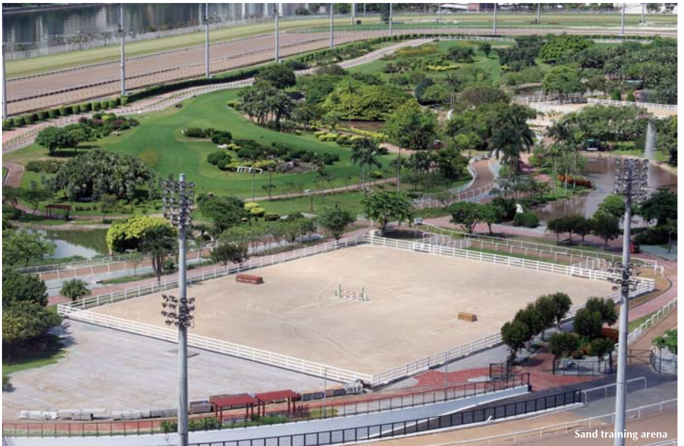
Sand training arena