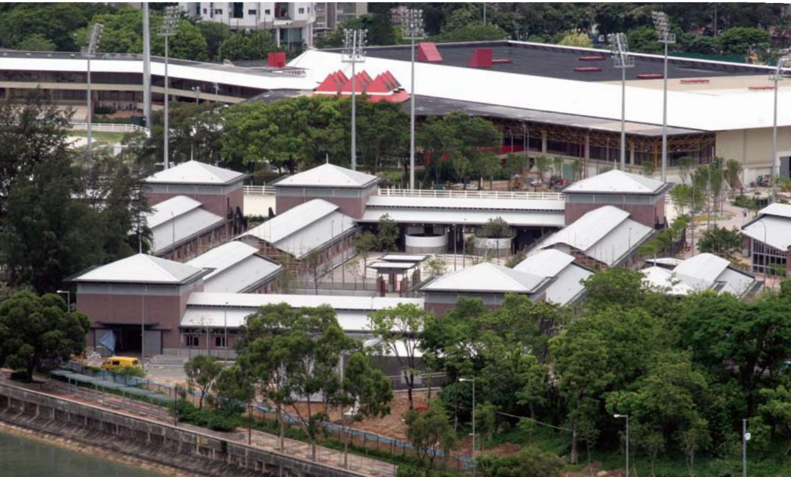
Main stabling complex

and training arena which will accommodate the Dressage and Jumping events. The HKJC also provides facilities at the HKGC and the Beas River Country Club for the cross-country section of the Event competition.