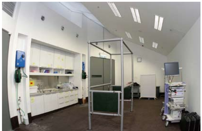
Examination room in Equine Clinic

To provide a more comfortable environment, the HKJC has provided an air-conditioned indoor training arena. This is the first-ever indoor Olympic equestrian training facility to be equipped with air