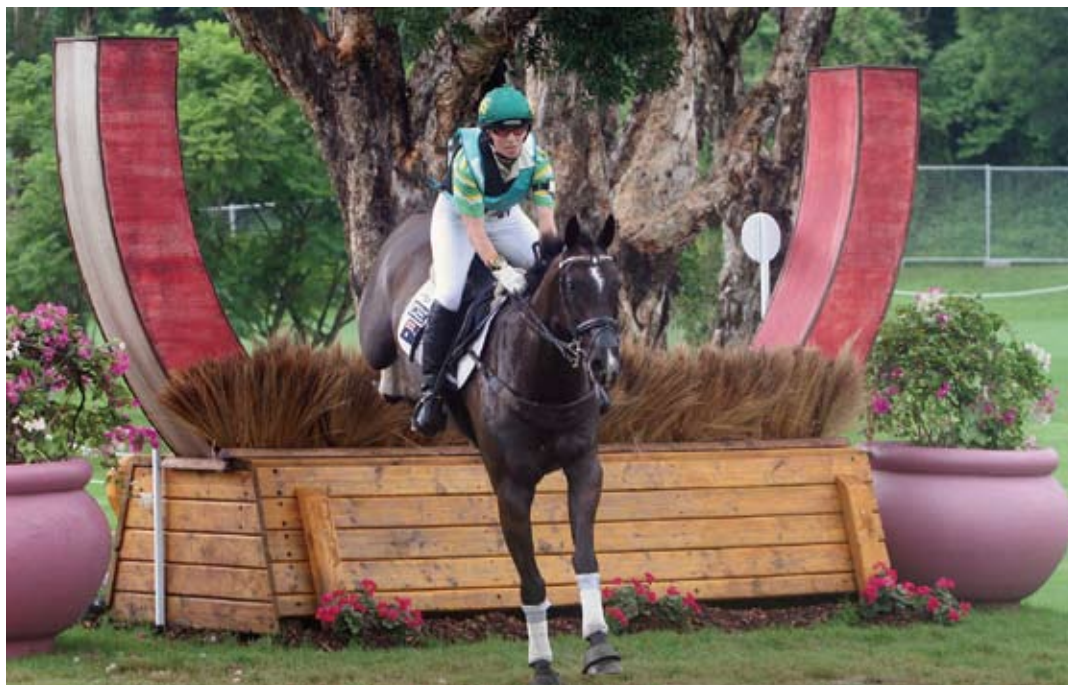
Olympic cross-country course