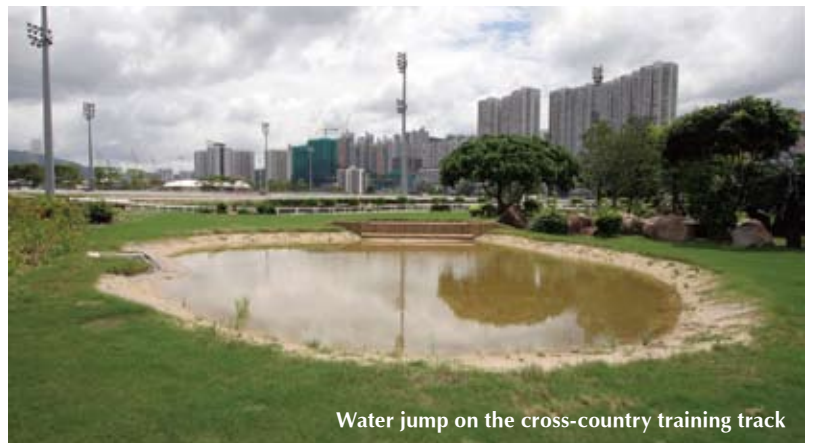
Water jump on the cross-country training track