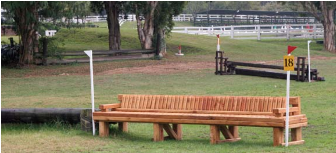
Jumping fence for cross-country event