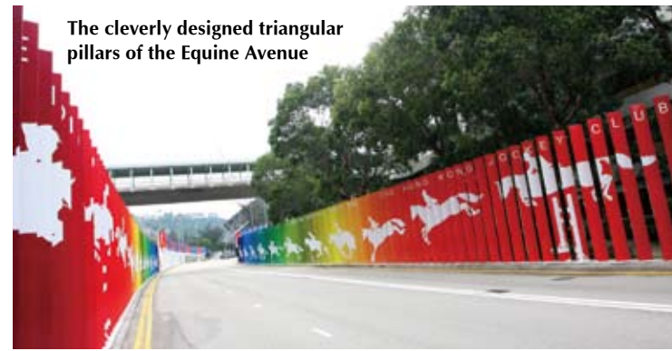
The cleverly designed triangular pillars of the Equine Avenue