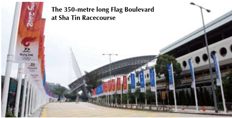
The 350-metre long Flag Boulevard at Sha Tin Racecourse