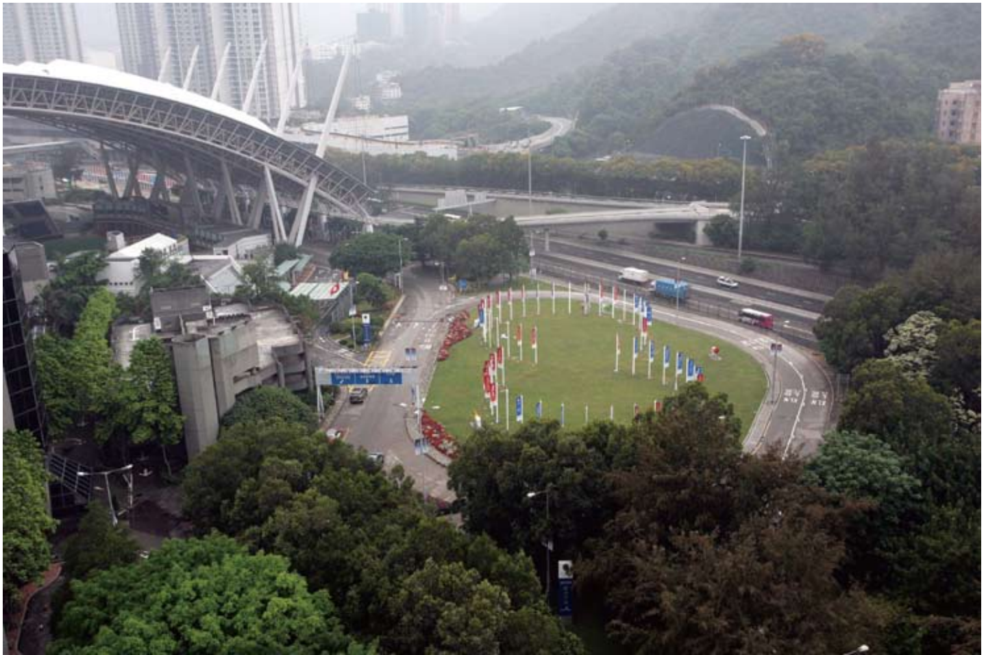
The Flag Plaza at Sha Tin Racecourse