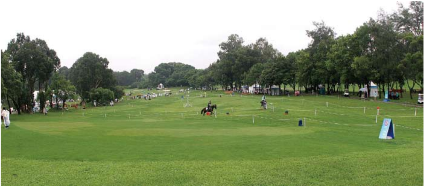
Spectators out on the Olympic cross-country course

At Beas River, the venue was converted from Beas River Country Club and the adjacent HKGC. An approximately 5.7-km temporary Cross-Country track measuring 10 metres in width was constructed. The facilities also include a warm-up area, a cool down area and a stable block for 80 horses. The HKJC has invested around HK$28 million in the cross-country footing at Beas River,