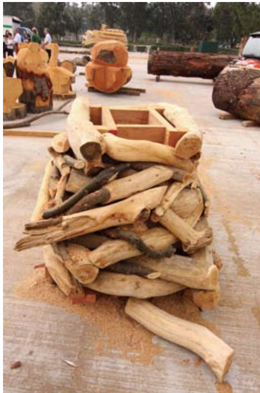
Jumps in cross-country course