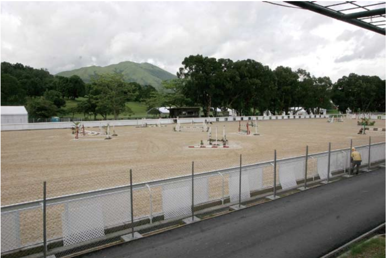
Sand training arena