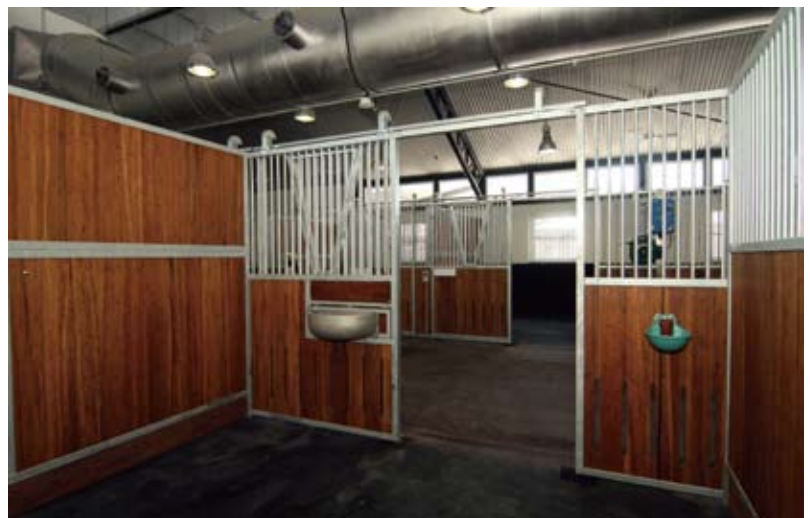
Timbers manufactured from recycled bamboo are used in the horse stalls